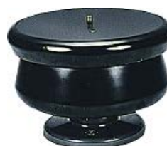
P32CT continuous flow rotor

If you have any inquiry of this application or products, please contact us through our web site.