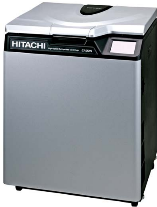
CR22N High-Speed Refrigerated Centrifuge