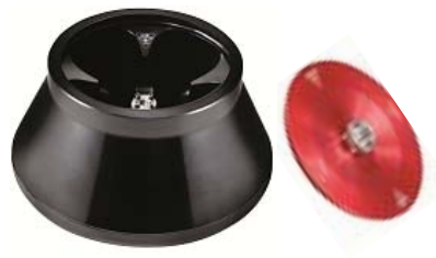
R9A2 Angle Rotor

For any questions about these materials, visit the website of Hitachi Koki Co., Ltd. at : http://www.hitachi-koki.co.jp/contact/