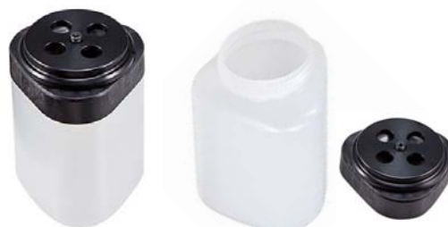
1500PP (WM) bottle