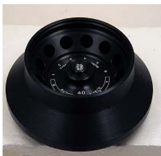
T15A45-type angle rotor

Reference : M.G.Murray and W.F.Thompson (1980) Rapid isolation of high molecular weight plant DNA, Nucleic Acids Res. 8 :4321-4325.